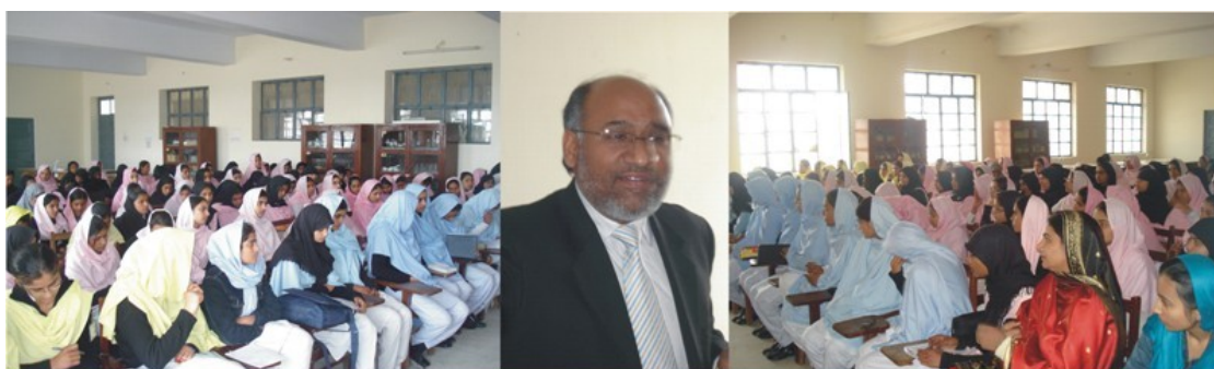
Eduvison Career Planning Seminar - Govt College for Women, Pind Dadan Khan

Short-listed applicants will be required to bring proof of TOEFL registration with them to the interview.