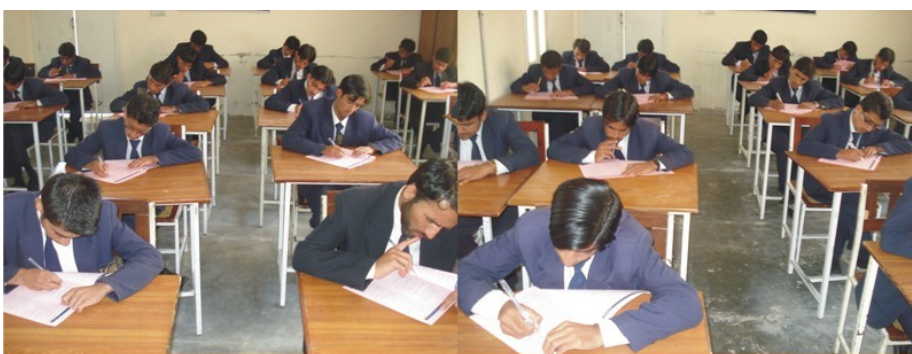
Career Planning Workshop at Al-Hijrah School & College, Ziarat (Balochistan)